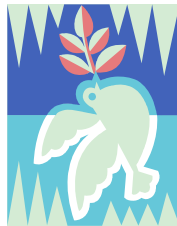
Chart your course