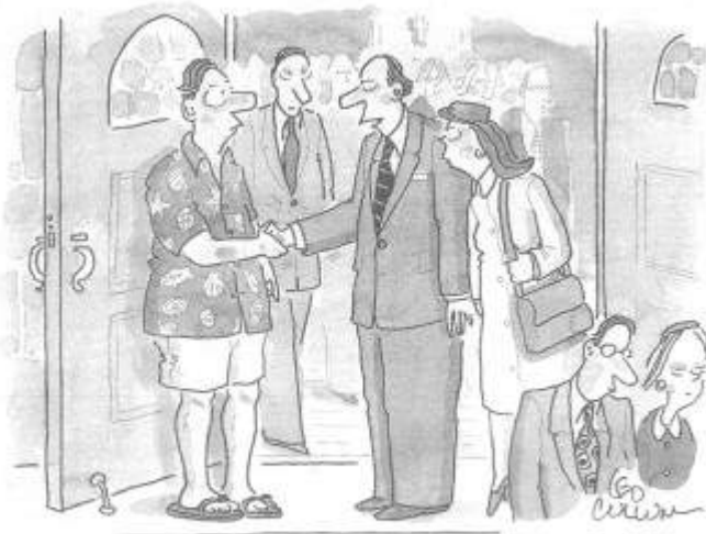
"Loved the sermon. Hated casual Sunday."